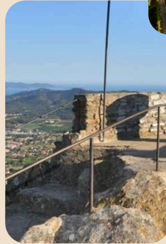
Our Lady of Constance