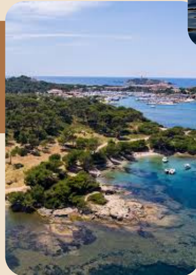
The Hyères Islands (Porquerolles, Levant, Port-Cros)